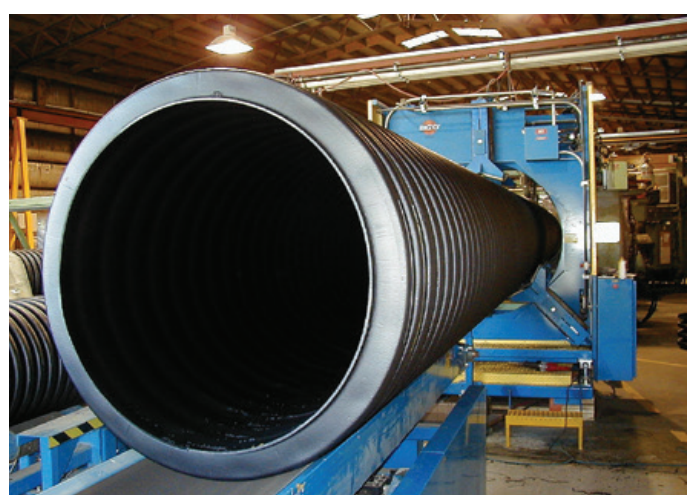
BOSS HDPE PIPE PRODUCTION USES ADVANCED MANUFACTURING TECHNOLOGY