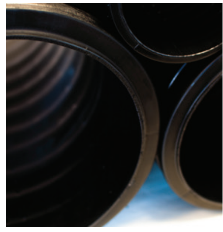
BOSS 2000 VARIOUS SIZES TO ACCOMMODATE ALMOST ANY PROJECT

A selection of non-woven geotextile sock is also available for critical applications. Armtec carries a complete line of geotextile products in rolls for a complete trench wrap French drain package. Armtec can recommend a material type for all applications.