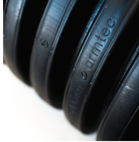
BOSS 2000 DETAIL OF 300mm