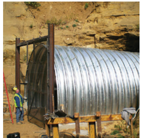
BAY CITY MINE - WISCONSIN, USA