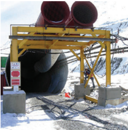
KUMTOR GOLD MINE - KRYGYZSTAN