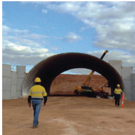
MARRADONG MINE - BODDINGTON, WESTERN AUSTRALIA