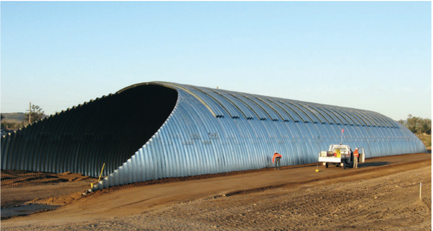
ANGLO COAL, CENTRAL - QUEENSLAND, AUSTRALIA