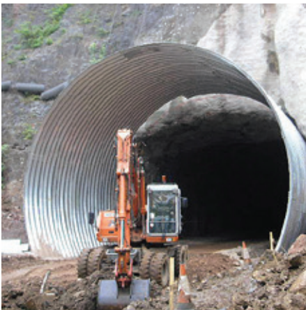
TAFF'S QUARRY - CARDIFF, UK