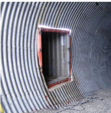
KUMTOR MINE - KYRGYZSTAN