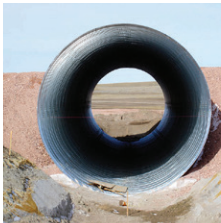
THUNDER BASIN COAL MINE - WYOMING, USA