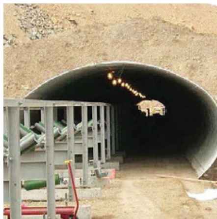
CORTEZ GOLD, ELKO - NEVADA, USA