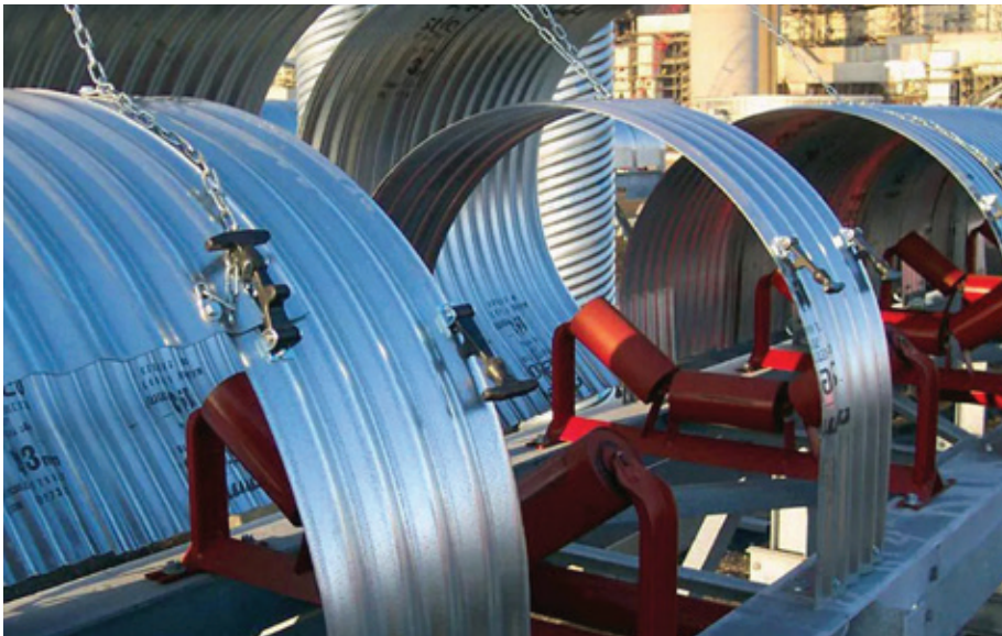
3/4 HINGED LOCKABLE COVER