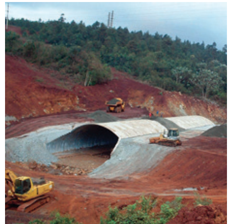
NICKEL MINE - MOA, CUBA