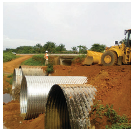
LIBERIA - AFRICA