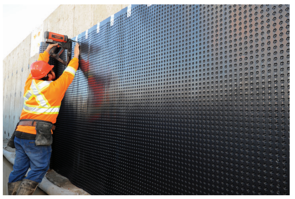
INSTALLING SPEEDCLIPS EVERY 30CM (12")