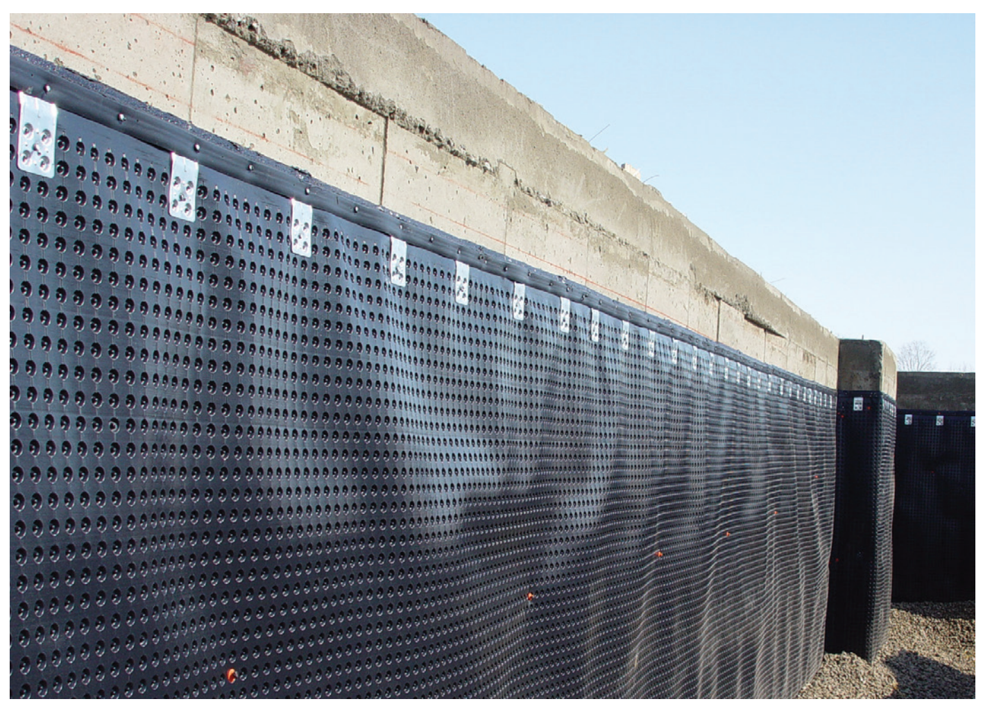
FINISHED INSTALLATION OF PLATON FOUNDATION WRAP